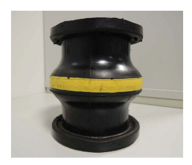
Marking without "ERV" and Elaflex rhombus © on the circulating coloured band.