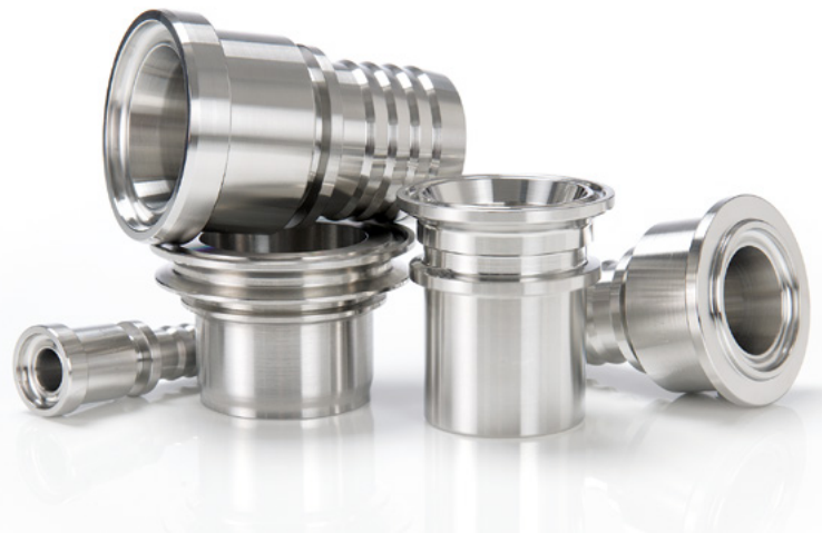
Crimping 'free of dead spaces / flared'

Crimped hose coupling with flush-mounted hose tail. No obstruction of inner cross-section, almost no gap or dead volume between lining and hose tail. For high purity requirements. Suitable for all coupling types.