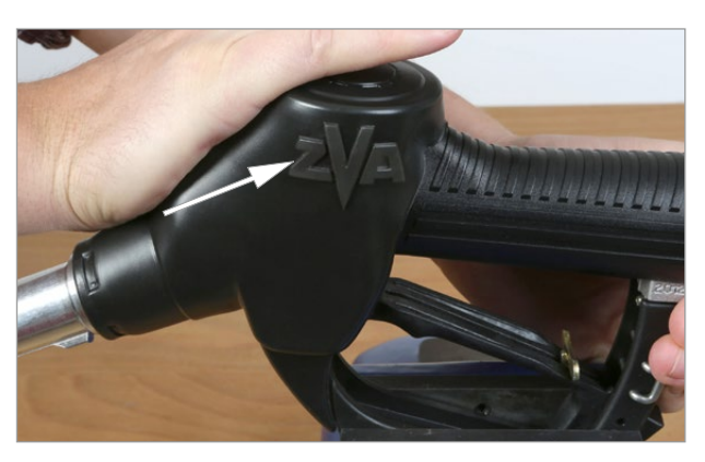
3) Push the Scuffguard further as shown in order that the Product Sleeve can be fitted correctly.