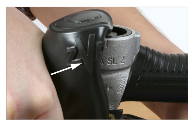
Push the Scuffguard over the spout as shown. Then put fingers slightly below the Scuffguard to pull it onto the nozzle body.