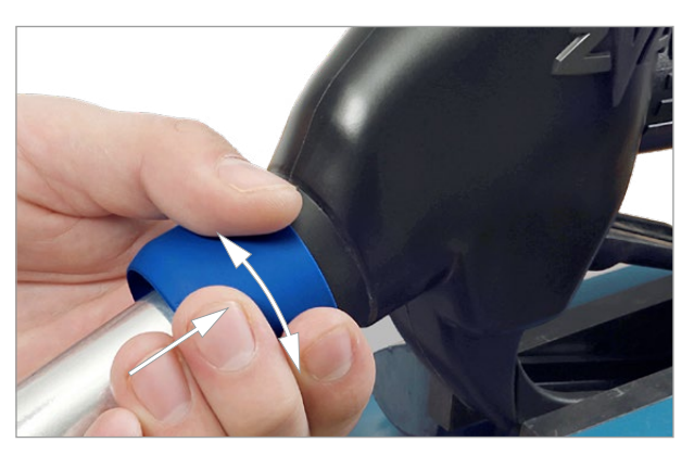
4) Push Product Sleeve (or Splashguard EK 652) onto the Scuffguard. While pushing the Product Sleeve, turn it until it snaps in properly.